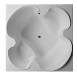
Tub pictured with optional grab bar and waste & overflow.